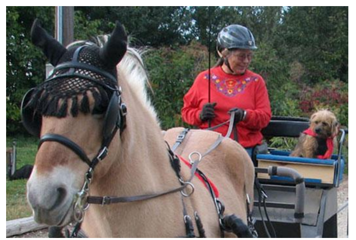
(I need to send this picture in to them!)

http://www.americandrivingsociety.org/carriage_dog.asp